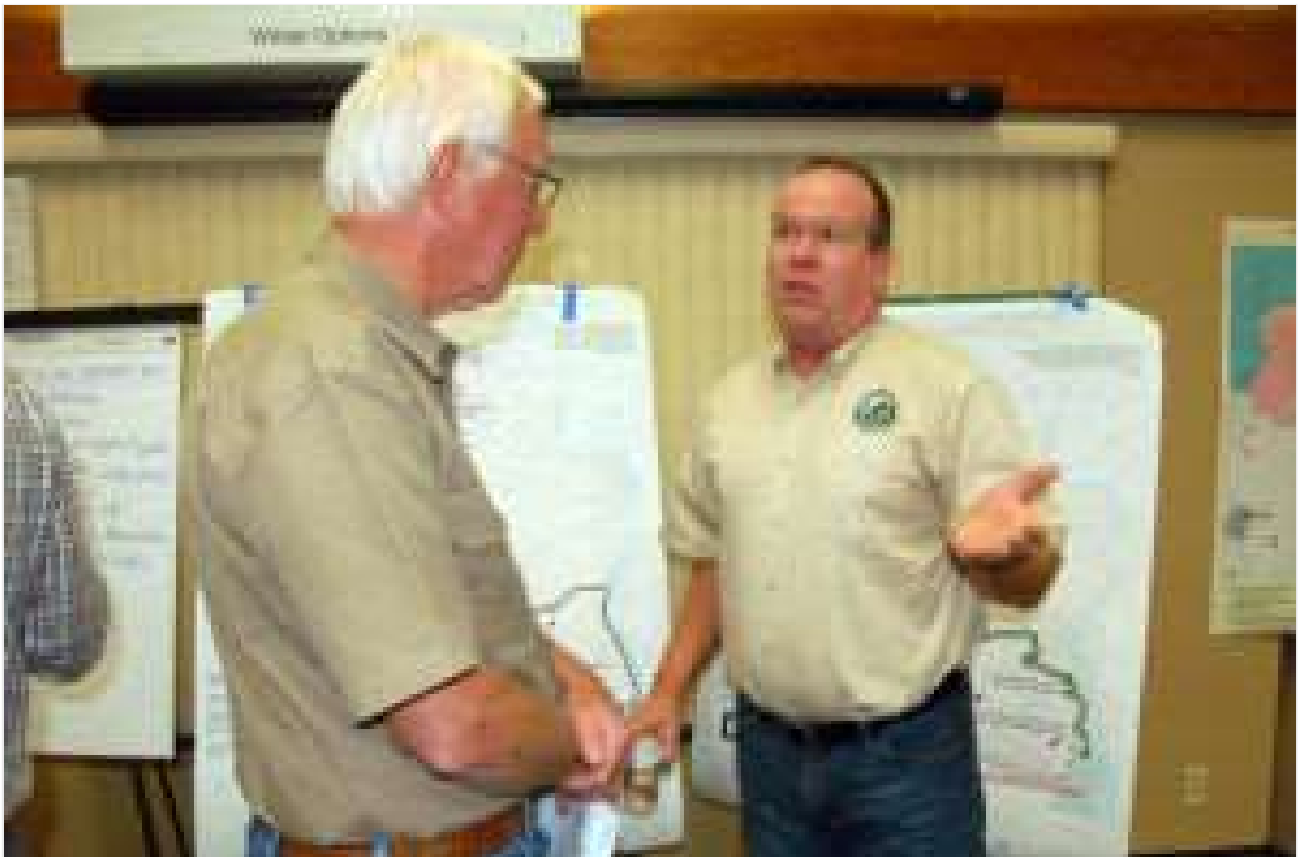
Recreation plan unveils options for Naneum-Columbia River